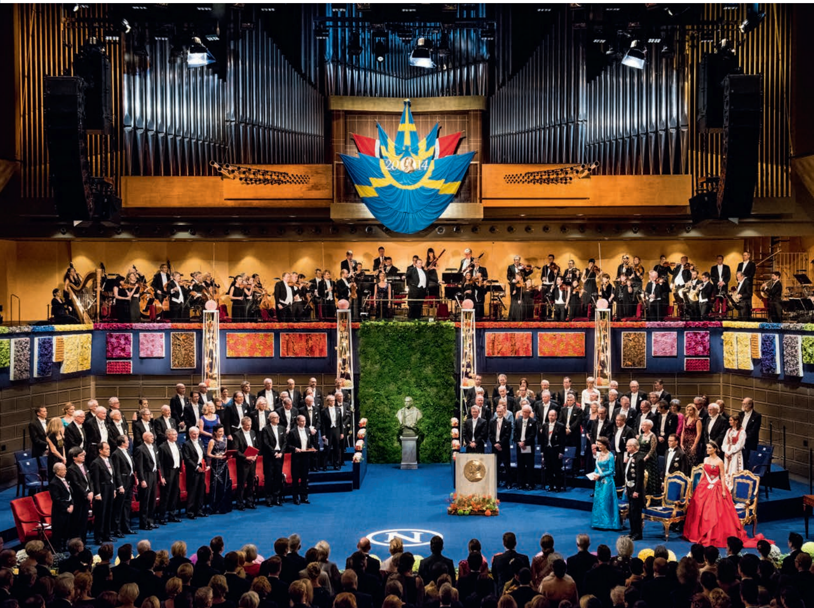
Nobel Prize awards ceremony • Stockholm, december 10, 2014

2014 NOBEL PRIZE IN PHYSIOLOGY OR MEDICINE LAUREATES